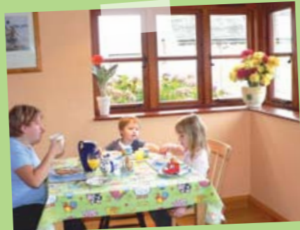
This is exactly what we offer you and much more....

Add nursery teas and baby sitting and we would have the perfect holiday.